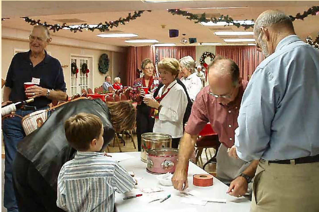
There were 33 at the Christmas Party held at the Orange Acres clubhouse on Dec 11th.

The newsletter of the Florida West Coast Woodworkers Club, Inc. An organization of men and women who are devoted to increasing their skills in woodworking.