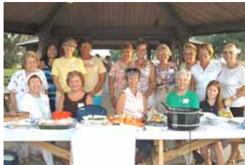
The lady guests are shown here behind the food table which they surely had a hand in preparing.

Look forward to seeing everyone next year!