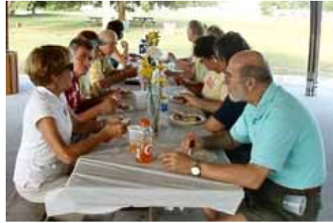
We all had a great time of visiting and eating all of the wonderful food.