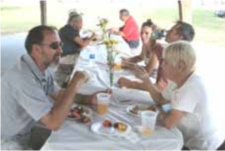
This was a great afternoon for a picnic.