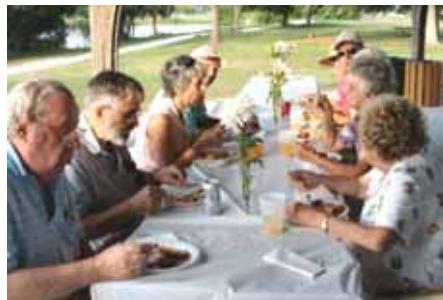
Twin Lakes park is the ideal place for our summer picnic.